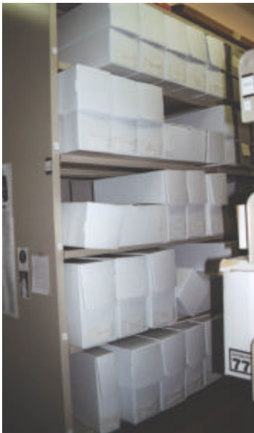
Ruh fonds: 7m of documents and photos