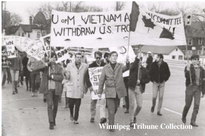
Students protest Vietnam War.

As the numbers of Canadian veterans continue to dwindle, it is of vital importance that archivists and historians make a concerted effort to recount the history of all Canadians during times of conflict, at home and abroad, so that it is not lost to future generations. The University of Manitoba Archives & Special Collections has attempted to do just that through the creation of its latest on-line endeavour, “The Canadian Wartime Experience: The Documentary Legacy of Canada at War.” Over ten thousand documents and photographs, from nineteen collections within the Archives’ holdings, have been digitized and mounted on the Internet. These images detail Canada’s role in a number of conflicts including the Red River Resistance, the Boer War, the First and Second World War, the Korean War, and the Vietnam War.