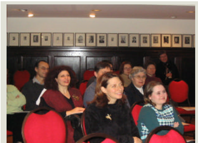
Members and guests enjoy stories