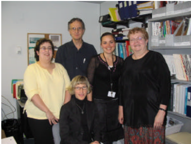
2004-2005 AMA Board