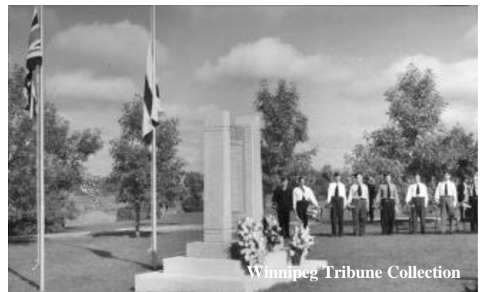
Winnipeg Tribune Collection Memorial Ceremony